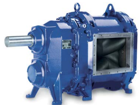
Vogelsang rotary lobe pump of the VX series

outstandingly compact type of construction, are very easy to maintain, and are extremely resistant to foreign matter. Toilet paper, pieces of fabric and other contamination that is commonly present in wastewater do not impair the rotary lobe pump's operation.